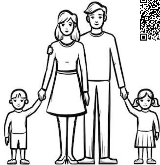
Nuclear family/ Small family